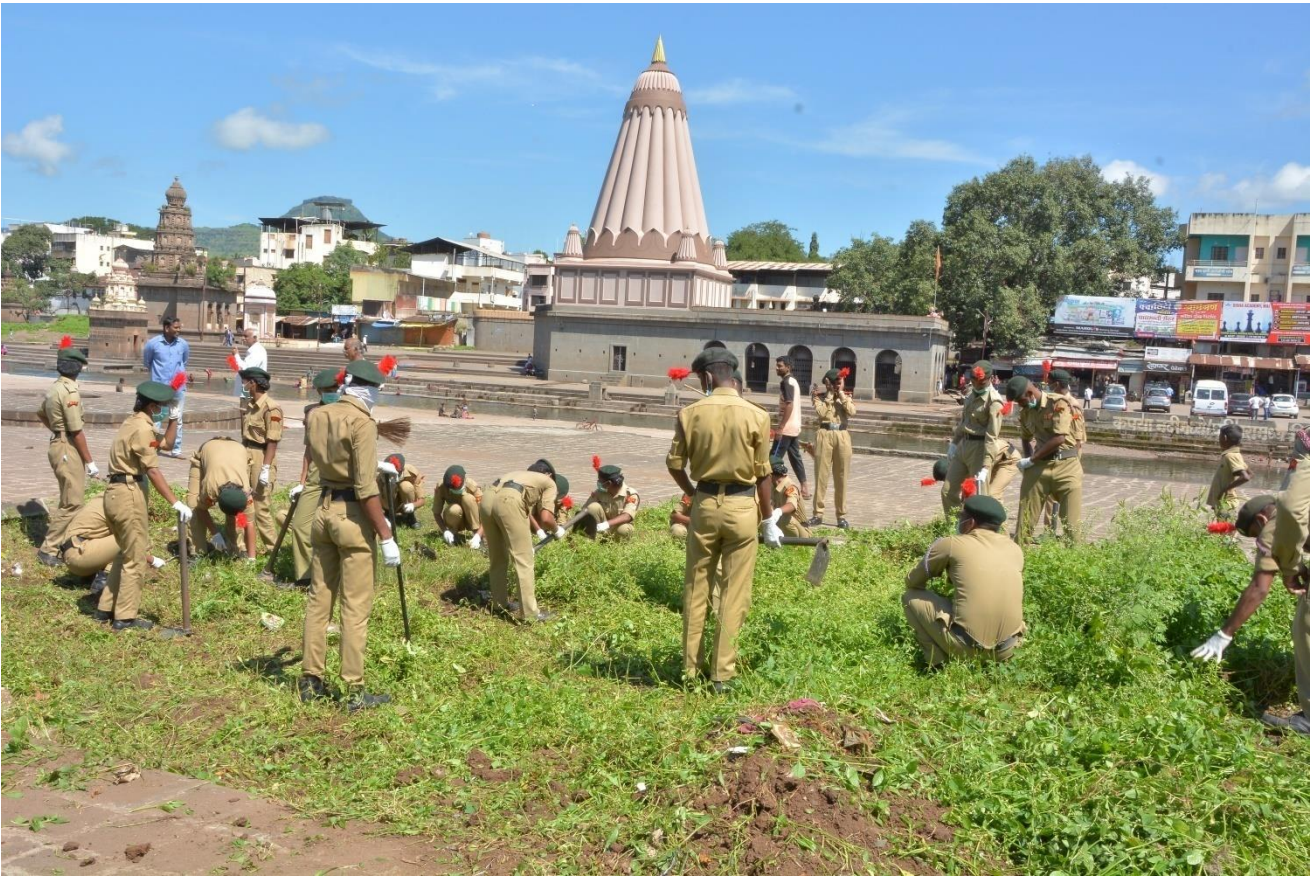
SwachataAbhiyan: Cleaning of GanpatiGhat, Krishna River 2019-2020